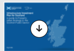
A guide to Property Asset Strategy in the Scottish Public Sector